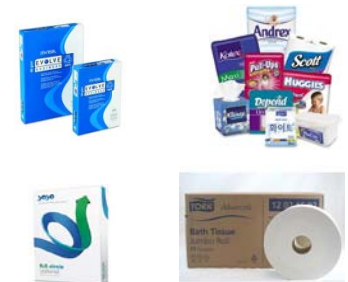
Recycled into new paper