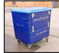
Approved secure containers